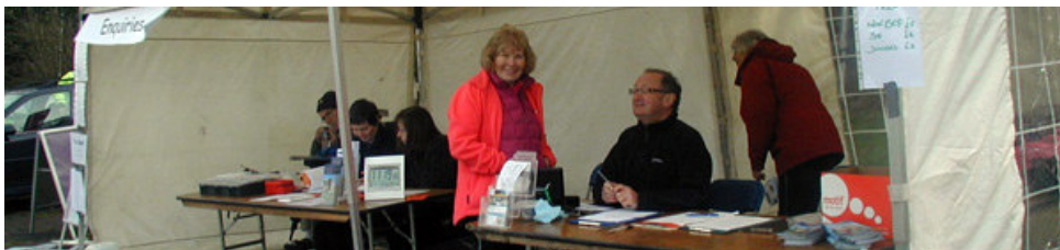
The registration & enquiries team ready for action at the Midland Champs at Belvoir Castle, March 2010