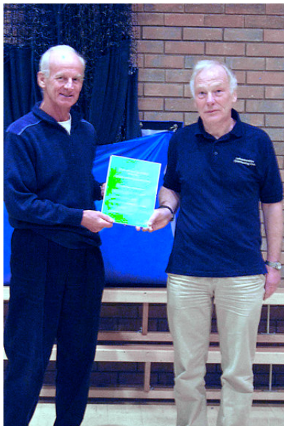
Retired man collecting the club's runner up award in Club of the Year at the BOF AGM