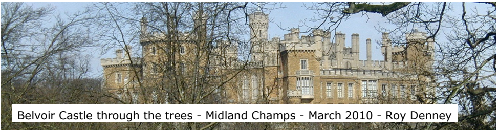
Belvoir Castle through the trees - Midland Champs - March 2010 - Roy Denney