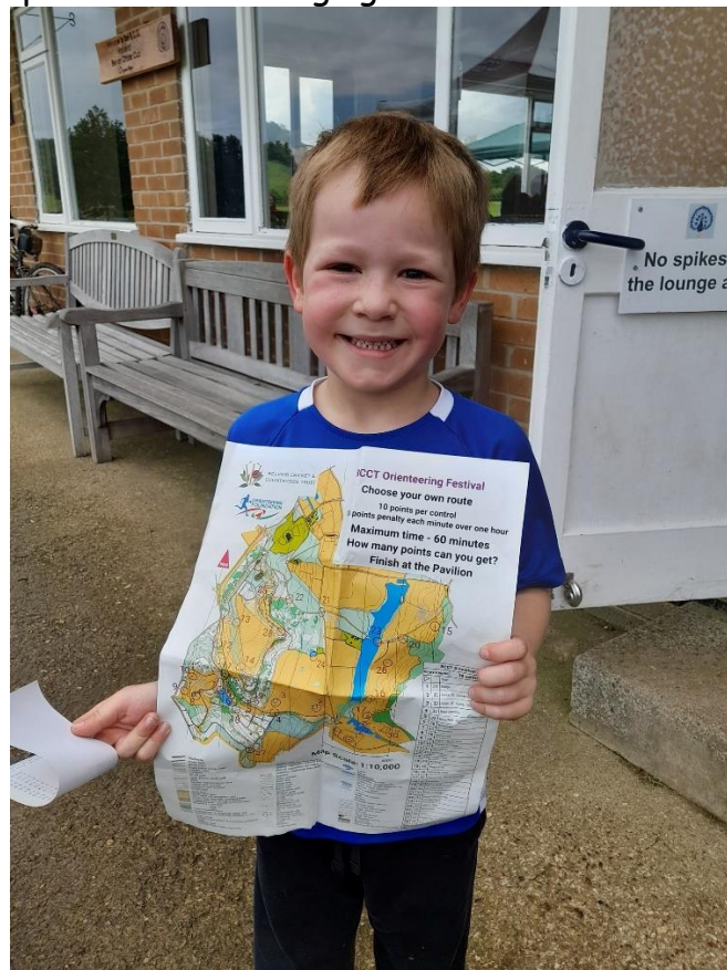
Picture 3: Great fun was had by the families that came to the festival.